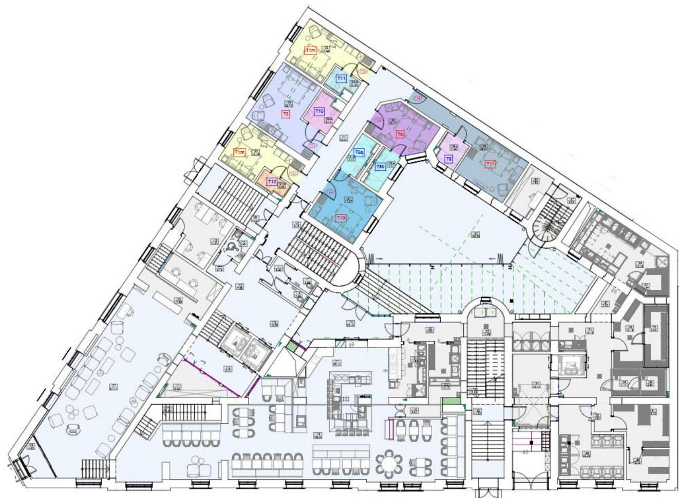
Планируемый план отеля 1-ого этажа